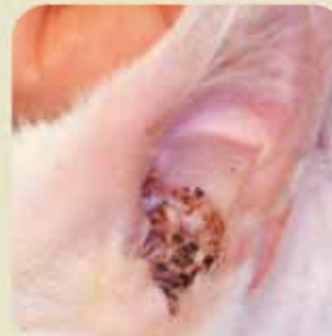
Otitis externa in a cat with ear mites ( Otodectes cynotis ). The photo shows the characteristic crusty brown discharge in the external ear canal