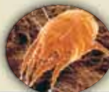
Electron micrograph of the ear mite – Otodectes cynotis