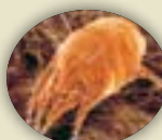
Electron micrograph of the ear mite – Otodectes cynotis